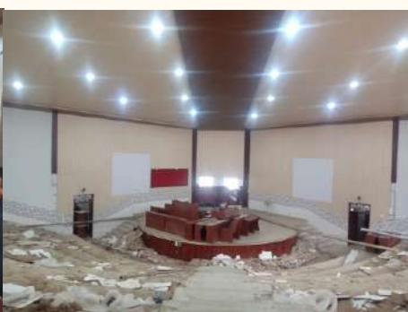
Interior Renovation of Auditorium