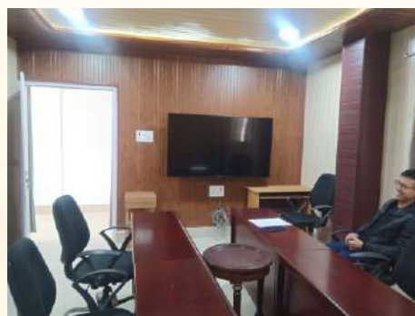
Video Conference Hall