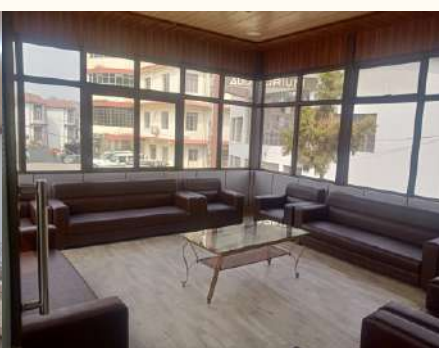
Resource Person Room