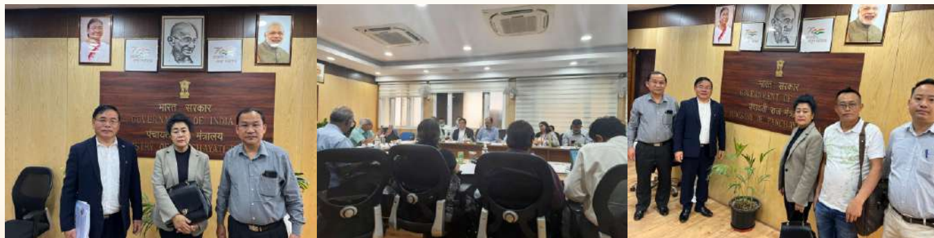
1 st Meeting of Central Empowered Committee (CEC) of Revamped Rashtriya Gram Swaraj Abhiyan (RGSA) with the Ministry of Panchayati Raj, Govt. of India on 17 th March 2023 at New Delhi.